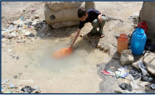
Water used as a weapon of war in Syria

When you think of the ways in which wars and conflicts are fought, water wouldn't immediately come to mind, but in many conflicts, restricting or controlling the access to water can be used as a weapon. There are different ways that water can be used as a weapon, which include: