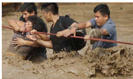
Extreme weather in Peru, March 2017