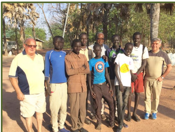
Christian Brothers and prospective students for the new De La Salle Secondary School for boys