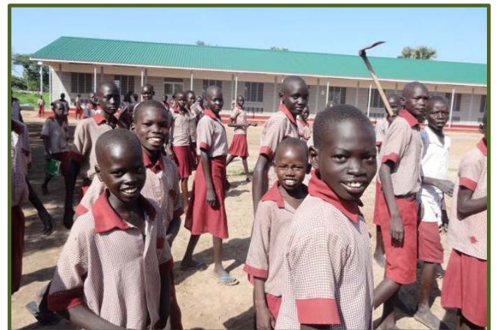
Primary students in front of new building

The Congregation of the Sisters of Bon Secours is a member organization of Friends in Solidarity, a USA organization that works in partnership with Solidarity with South Sudan to support its projects and other activities.