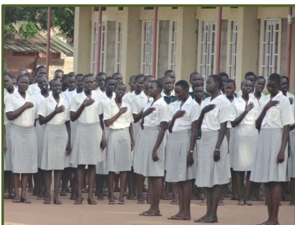
Students at a formal assembly - Loreto Secondary School for Girls