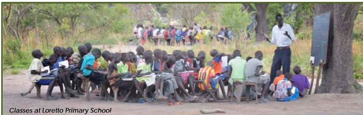
Classes at Loreto Primary School