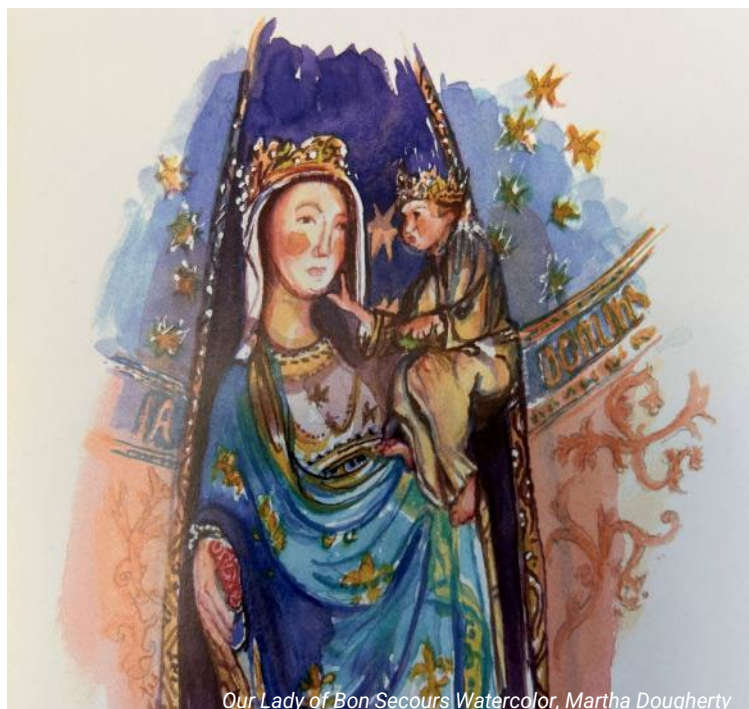
Our Lady of Bon Secours Watercolor, Martha Dougherty

Or maybe it is practicing the art of cultivating personal peace so that we can be peace to those suffering from domestic violence or violent conflict. Perhaps this pouring out looks like advocating with our lawmakers for policies that support our sisters and brothers living in poverty and our environment from destruction and destitution.