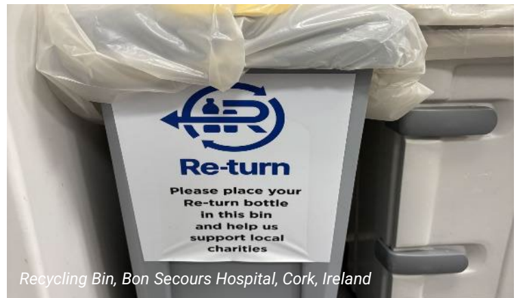
Recycling Bin, Bon Secours Hospital, Cork, Ireland

In the USA, Sisters and other advocates have been working for 2 years to advocate for a similar "bottle bill" for Maryland. Last year Sisters met with legislators about this important bill, and this year we are signing petitions to advance the bill. Hopefully Maryland will have a program similar to that of Ireland and France in the future.